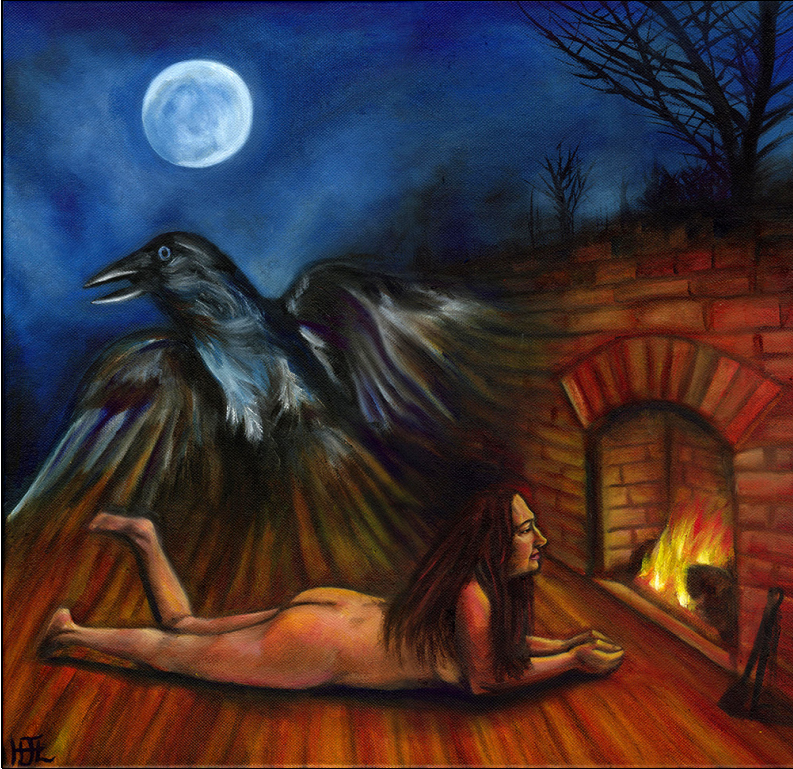
"Fire and Flight" Oil on Canvas, 16 x 16" February 2007

Commissioned portrait which incorporates symbols of the four elements, and addresses themes of hearth and wilderness.