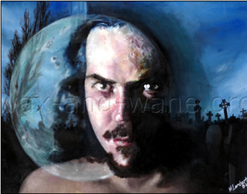
"Here Comes The War" Oil on Canvas, 20"x16" August 2004

Portrait of a werewolf character from the unreleased independent TV series "Love Like Blood"